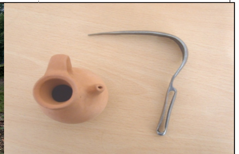
An oil jug and metal strigil used instead of soap by Roman bathers