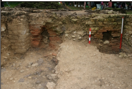
Hypocaust pilae part of the system used to heat the tepidarium and caldarium