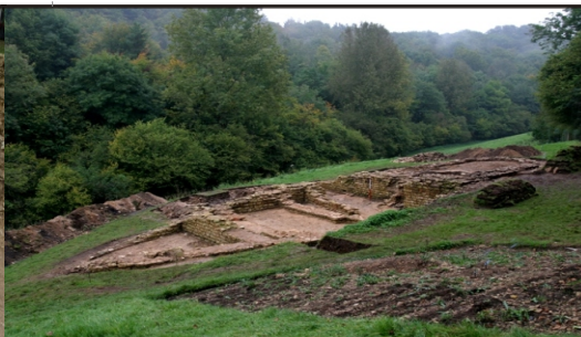
Truckle Hill Bath-house